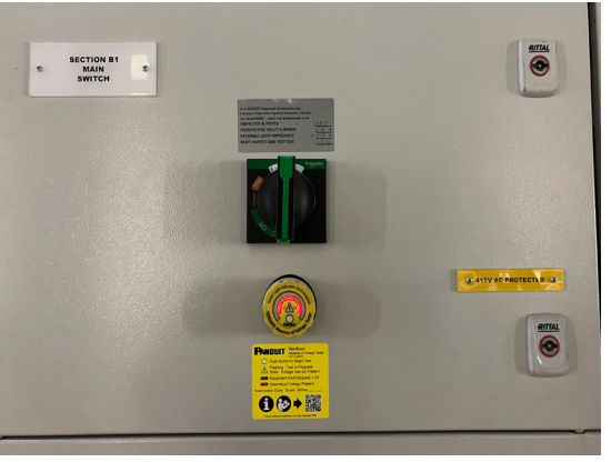
Additional Verisafe Absence of Voltage Tester in-situ

And the customer's maintenance engineers not only have the reassurance of enhanced electrical safety. They have also recouped around 50% of the time previously spent on voltage testing and LOTO procedures, to dedicate to more productive maintenance tasks to enhance operational efficiency and productivity.