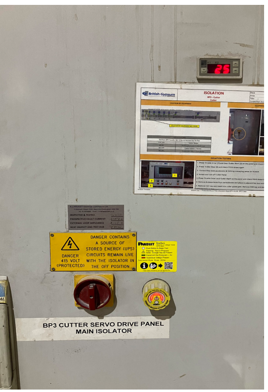
Verisafe Absence of Voltage Tester in-situ