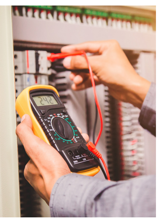
Electrical panel undergoing testing

Using the VeriSafe<sup>™</sup> AVT, all the engineer needs to do is activate the automated tester, note the indicator status and – if a green indicator is illuminated – open the enclosure to start work. At no time throughout the sequence of events – which in any case takes just seconds – is the engineer exposed to any electrical hazard.